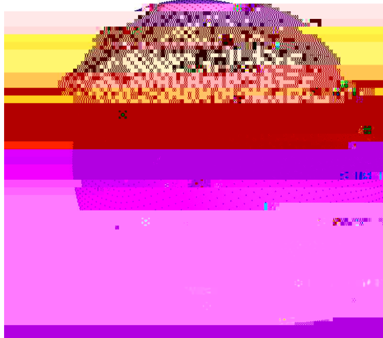
Figure 3.2. Positions of 7212 quadrature nodes of a quadrature integrating exactly all spherical harmonics in the subspace of maximal order and degree 145. This quadrature has efficiency \eta = 0.98521\dots

uniquely determine the number and type of generators for which the triangle P_0P_1P_2 serves as a template. Thus, t and s uniquely determine the total number of unknown parameters in the nonlinear system (3.7). We illustrate this construction in Figure 3.3.